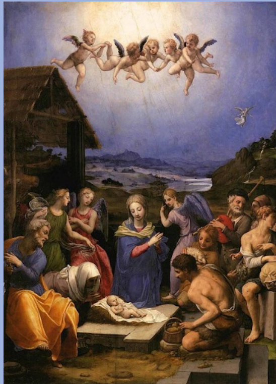
The Epiphany of Our Lord Jesus Christ ( The Adoration of the Magi , Hieronymus Bosch, ca 1475)

www.standrewskentct.org * 860.927.3486 * st.andrew.kent@snet.net